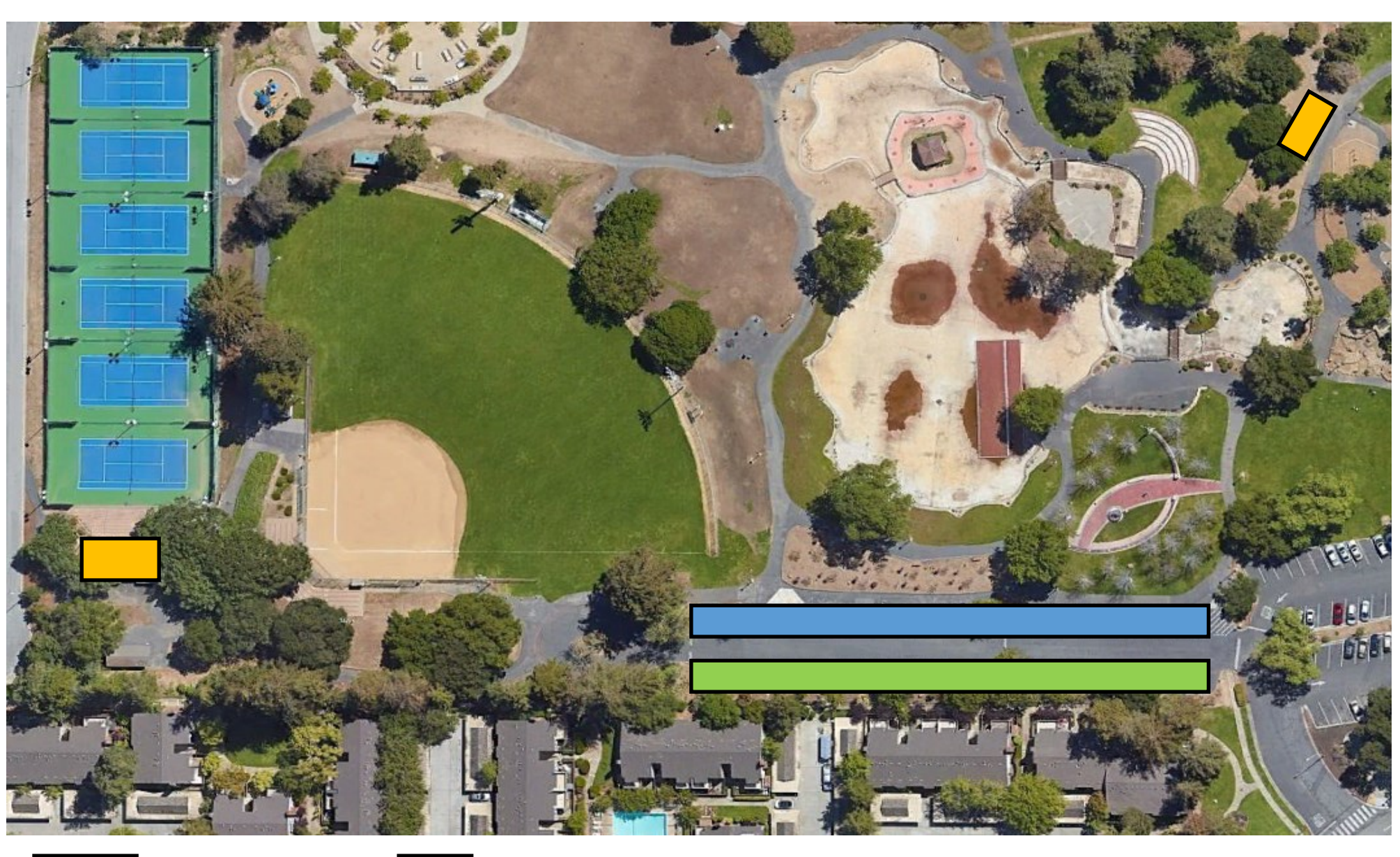
Exhibit A - Site Plan