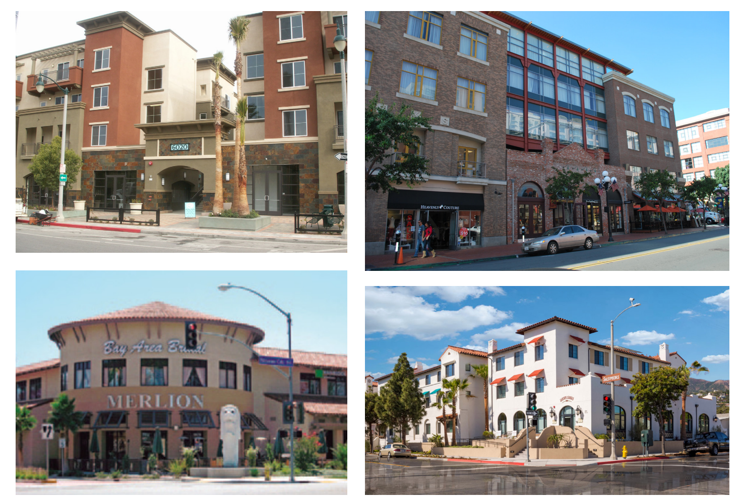
Opportunity for awning/overhang or change in color/material.

Examples of primary building entrances with pedestrian scale and orientation - tower elements at lower heights, attached roof forms at lower height, awning/overhang, and change in color/material.