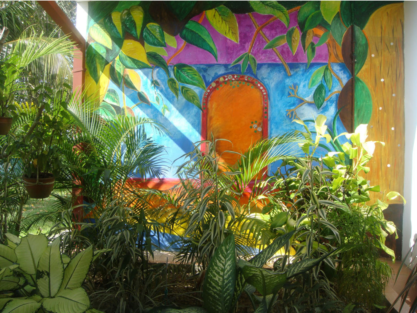
Entrance to Balarpur Industries's CEO's Residence Villa, Sipitang, Malaysia 2007 10 Feet x 10 Feet