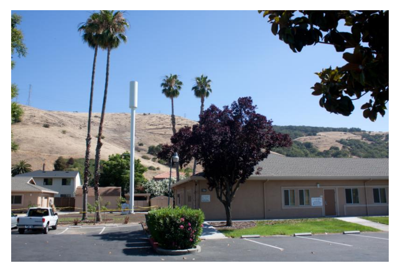
366 St. Julie Drive, San Jose