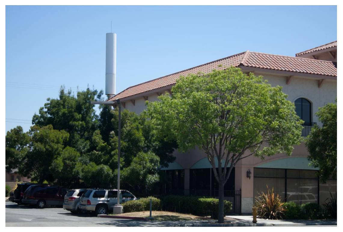
2110 Story Road, San Jose