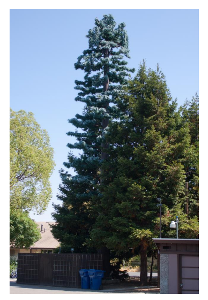
12770 Saratoga Ave, Saratoga