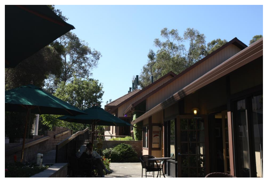
14407 Big Basin Way