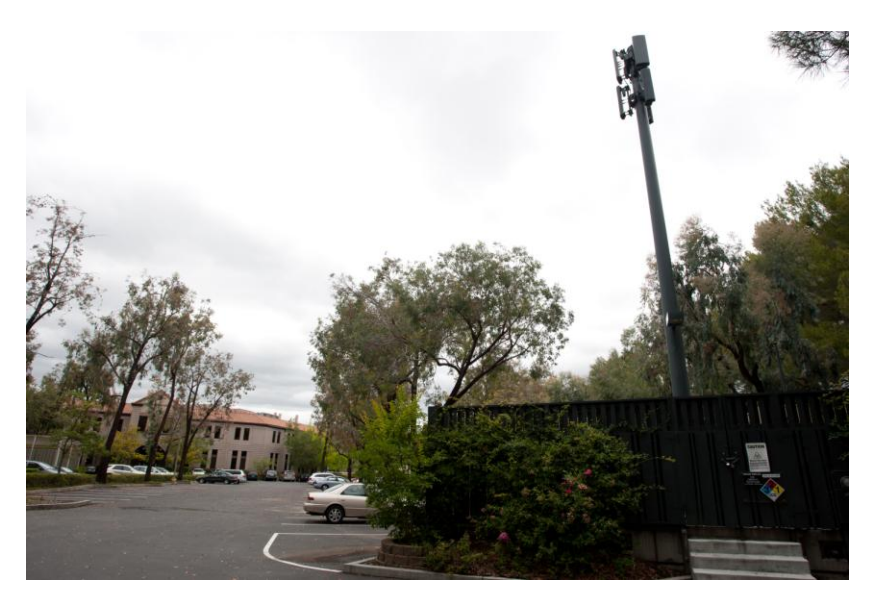
4009 Miranda, Palo Alto