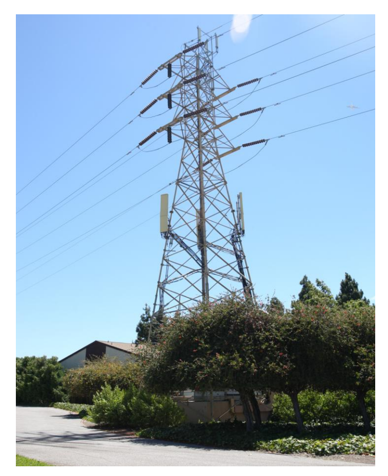
1082 Colorado St. Palo Alto