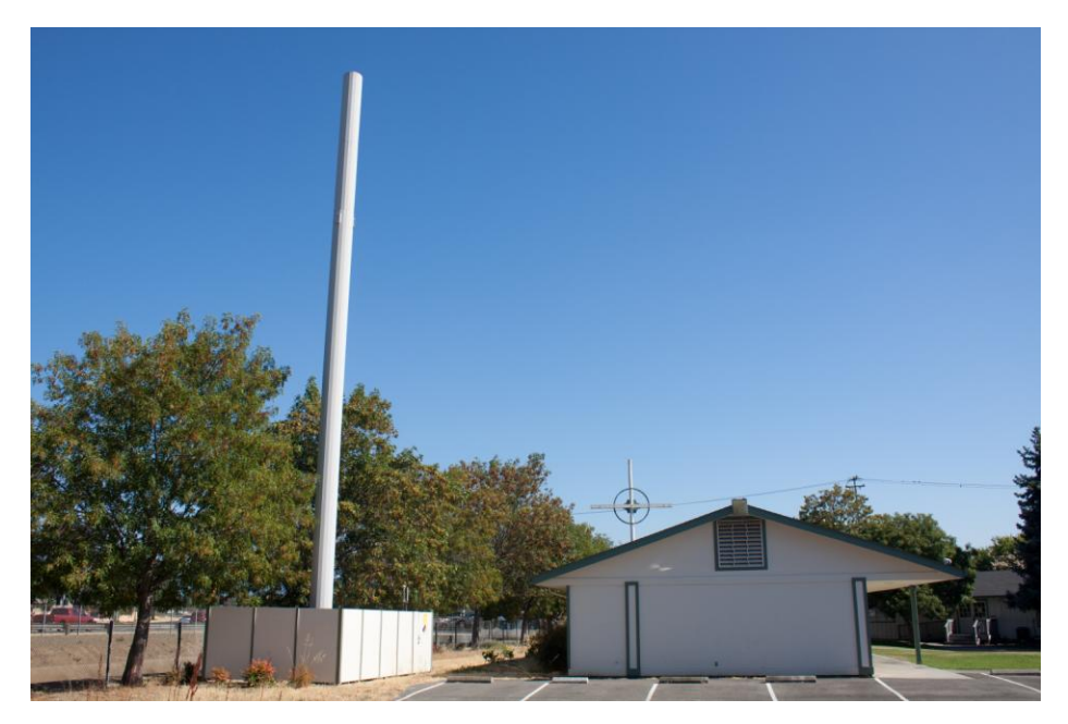
3675 Payne, San Jose