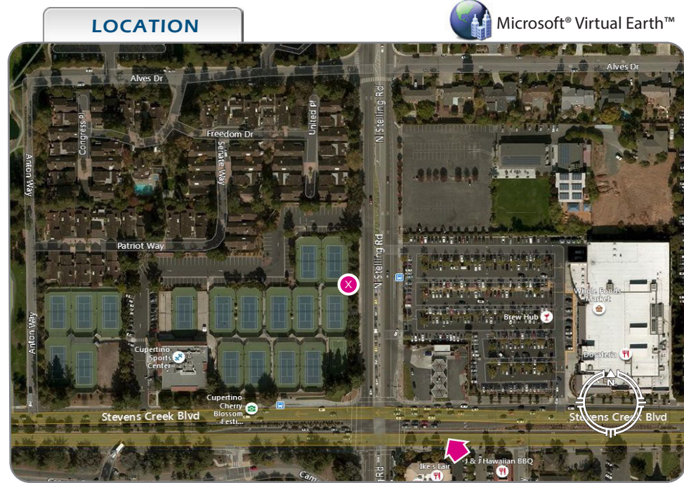
View from the Southeast looking Northwest