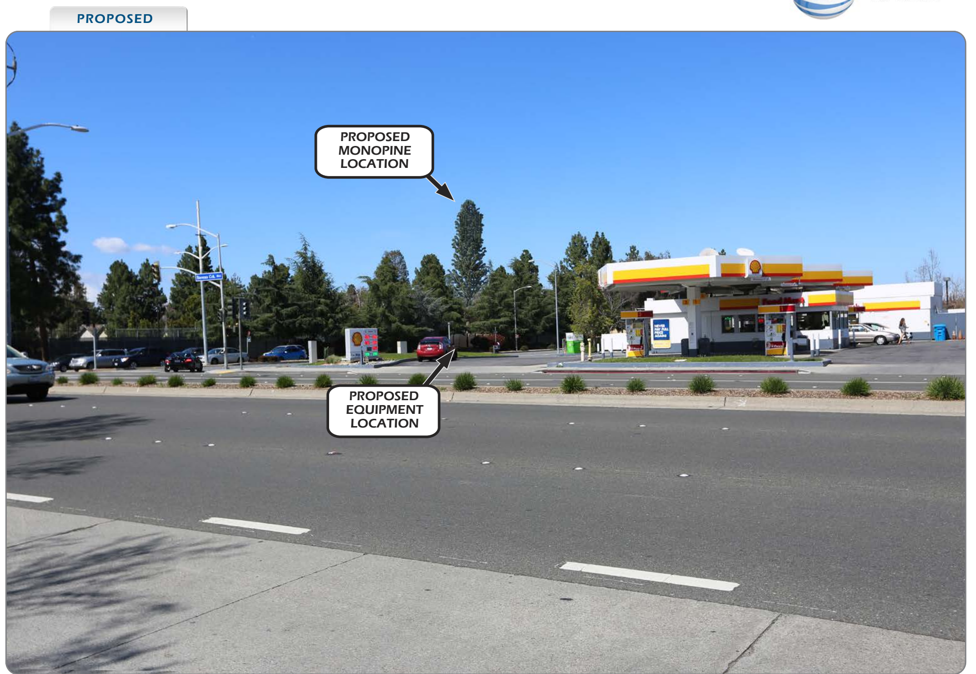
Completed March 23, 2019

CCL04011 CNU4011 Cupertino Sports Park 21111 Stevens Creek Boulevard Cupertino, CA 95014