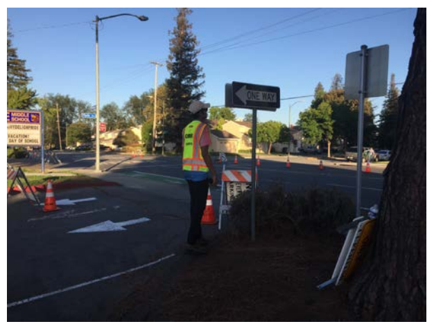
Awaiting July 4<sup>th</sup> fireworks & crowds. Hyde Middle.