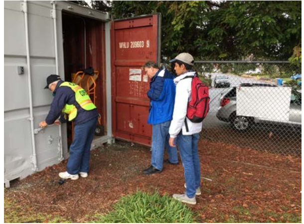
Wrapping up ARK check. Regnart Elementary ARK.