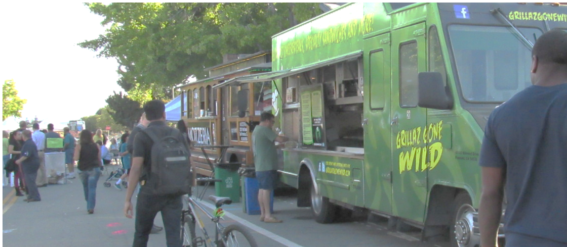
Fremont Street Eats

Beginning in 2013, the City of Fremont began working with the Fremont Chamber of Commerce to establish a weekly food truck event in Downtown Fremont. Fremont Street Eats is now a weekly event in its third season, sponsored by the Chamber. Street Eats was intended as an economic development program intended to help activate the Downtown. Many existing businesses, including small retailers and restaurants, consider the program a successful economic development effort because it helps bring pedestrian traffic to an area that was historically underused.