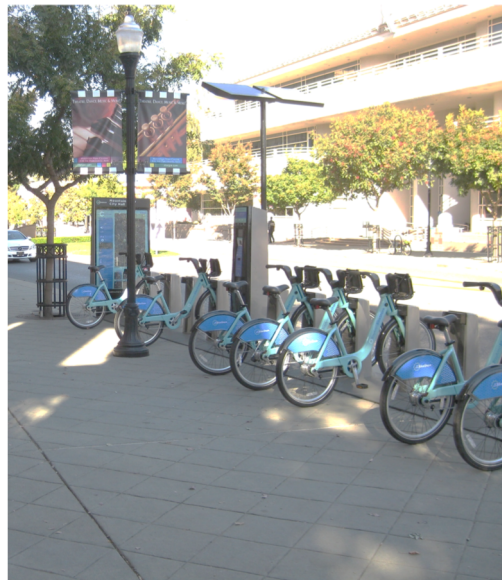
Downtown Mountain View