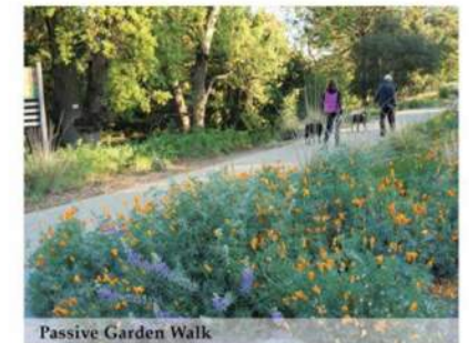
Passive Garden Walk