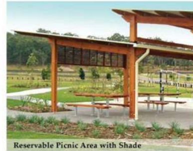
Reservable Picnic Area with Shade