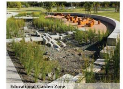
Educational Garden Zone