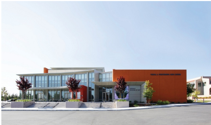
Euphrat Museum of Art

The highly regarded Euphrat Museum of Art, at its new location next to the new Visual Arts and Performance Center at De Anza College, presents one-of-a-kind exhibitions, publications, and events reflecting the rich diverse heritage of our area. The Museum prides itself on its changing exhibitions of national and international stature emphasizing Bay Area artists. Museum hours are 10 a.m. – 3 p.m. Monday through Thursday. Telephone: 408-864-5464