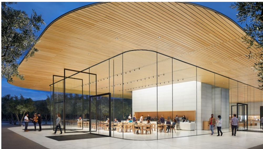
Apple Park Retail Store

Recently approved is the redevelopment of The Oaks Shopping Center site, located off of State Route 85 freeway and across from De Anza College. The Westport Cupertino project will be a mixed-used development consisting of 259 housing units (Rowhouse/Townhomes, senior apartments) 35 memory care rooms, and 20,000 square feet of commercial space.