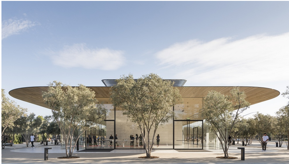
Apple Park Visitor Center

In the late 20th century, Cupertino and the surrounding areas experienced another surge in population growth, this time due to the immigration of people from Asian countries. Immigration laws at the time were in the favor of families looking to move to Silicon Valley. People immigrated here for a variety of reasons—whether they were aspiring for career prospects with major tech companies, or striving for quality education for their children, everyone who immigrated here had a common goal: to find opportunities to work hard for a better life for themselves and their families.