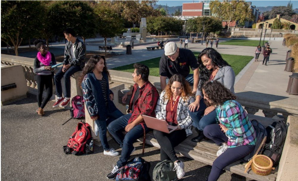
De Anza College Campus

Building on its tradition of excellence and innovation, De Anza College challenges students of every background to develop their intellect, character, and abilities; to achieve their educational goals; and to serve their community in a diverse and changing world.