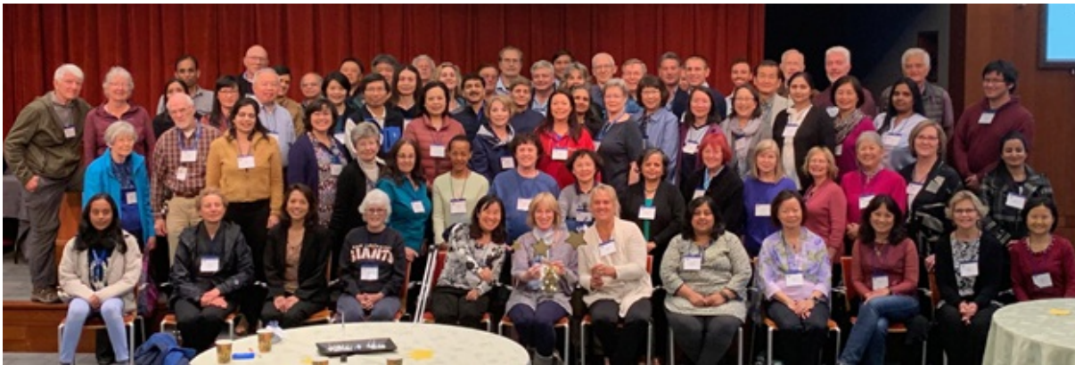
Neighborhood Block Leader Program

A connected community is a safer and more resilient community. Block Leaders are engaged Cupertino residents who go the extra mile to build a sense of trust and community in their neighborhoods. The program shares City news, hazards, and events with Block Leaders, provides support for community building, and organizes quarterly meetings. Meeting topics include crime prevention, emergency preparedness, and presentations from City Divisions to help residents learn more about their City. Leaders facilitate information sharing between the City and residents, host community gatherings, and build a sense of trust and safety in their neighborhoods. To become a Cupertino Block Leader, please contact the Block Leader Coordinator at martad@cupertino.org .