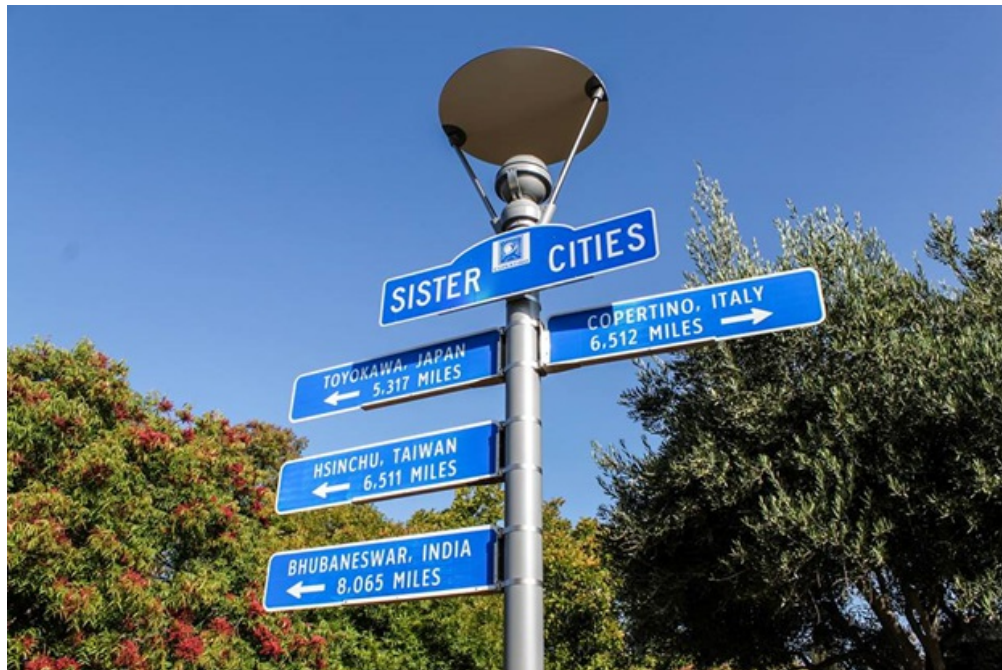
Cupertino Sister Cities Sign

The City of Cupertino recognizes the value of developing people-to-people contacts by strengthening the partnerships between the city and its four sister cities of Copertino, Italy; Hsinchu, Taiwan; Toyokawa, Japan, and Bhubaneswar, India. Cupertino's Sister City partnerships have proven successful in fostering educational, technical, economic, and cultural exchanges. Over the years, there have been many delegations visiting both the cities as well as many local students participating in annual student exchange programs.