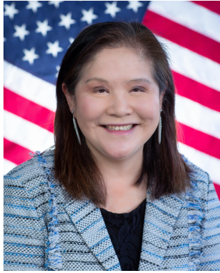
Hung Wei Mayor