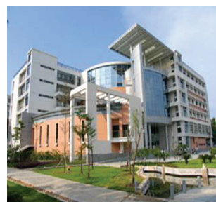
Figure 4 Zhaoqing University

Zhaoqing is one of the ancient cities in the history of China, first being named Gaoyao county in the Han Dynasty, before being changed to Duanzhou, Sihui and Gaoyao. It was finally renamed Zhaoqing in the Qing dynasty. Zhaoqing was one of the first places in inland China to be visited by a foreigner, the Jesuit priest Matteo Ricci who settled there in the sixteenth century.