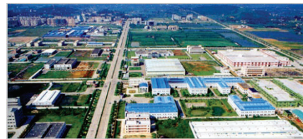
Figure 2 Factory area within the Zhaoqing High-Tech Industry Development Zone

Business Exchanges: The Committee will provide businesses from the two cities to identify areas of potential mutual collaboration. The Zhaoqing government is interested in investing in high-tech industries and has been encouraging industrial development including the formation of Guangdong Zhaoqing High-tech Industrial Development Zone, with an area of 42 square miles that consists of two industrial parks, Sanrong Industrial Park and Dawang Industrial Park. Dawang is facilitated as an export processing and trade zone.