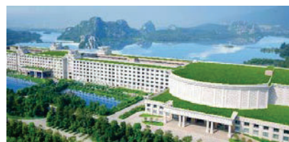
Figure 3 Top-rated hotel in Zhaoqing, the OYC Hotel

Zhaoqing is a city of almost 4 million residents in the Guangdong province of China. Zhaoqing is located about 70 miles northwest of Guangzhou, in the west Pearl River Delta. It lies on the north shores of the Xi River, which flows from west to east. Numerous rice paddies and aquaculture ponds are found on the outskirts of the city. A plain area lies to the south and west of Zhaoqing, with mountains to the east and north.