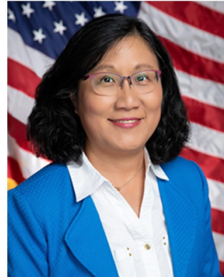
Liang Chao Vice Mayor