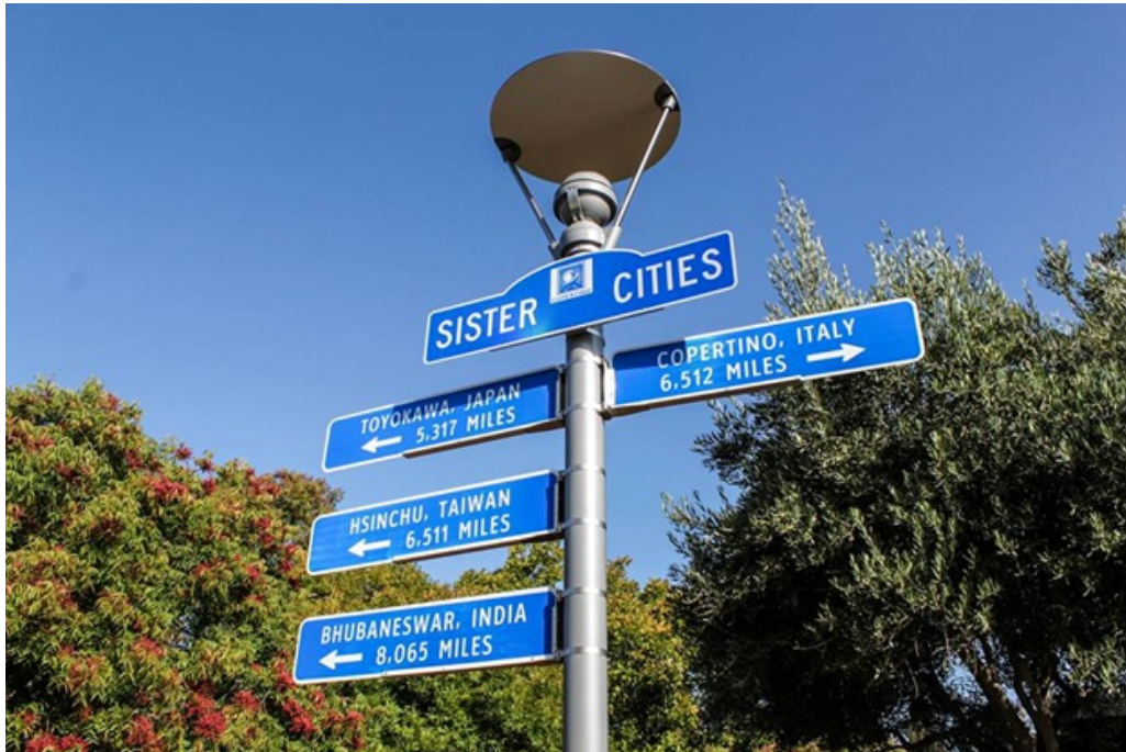
Cupertino Sister Cities Sign