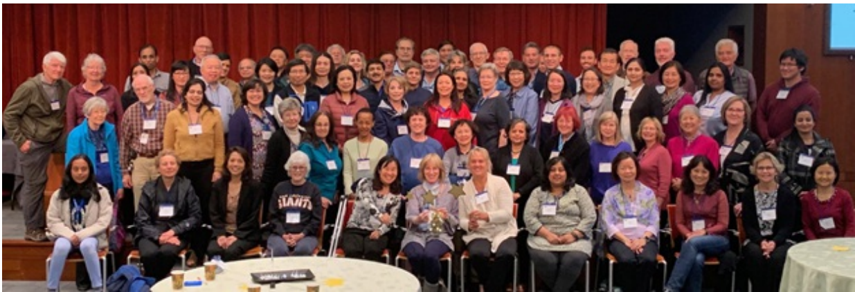
Neighborhood Block Leader Program

Good neighborhoods are those where neighbors work together on common issues and look out for each other. Block leaders take extra steps to connect neighbors and build community, making our neighborhoods safer and more resilient. The Block Leader Program teaches residents how to get to know their neighbors and how to organize activities so neighbors can more easily communicate with each other. Block leaders are vital links between City Hall and the neighborhoods.