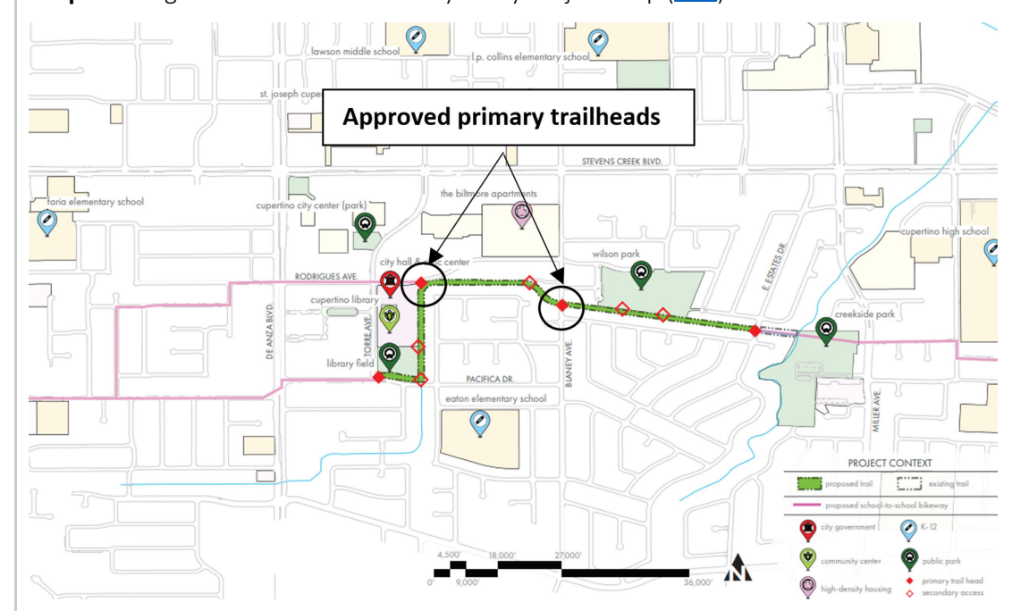
Graph 1 - Regnart Creek Trail Feasibility Study Project Map (Link)

Again, in the 2020 Initial Study/Mitigated Negative Declaration (IS/MND, link), section 3.1.2.3 confirmed the trailheads locations. To ensure pedestrian safety, the document pointed out that "A high visibility pedestrian crosswalk with Rectangular Rapid Flash Beacons (RRFBs) and Americans with Disabilities Act (ADA) ramp and curb improvements would be constructed at the South Blaney Avenue trail crossing" which showed consistency with City's effort to ensure the public safety when planning for this project.