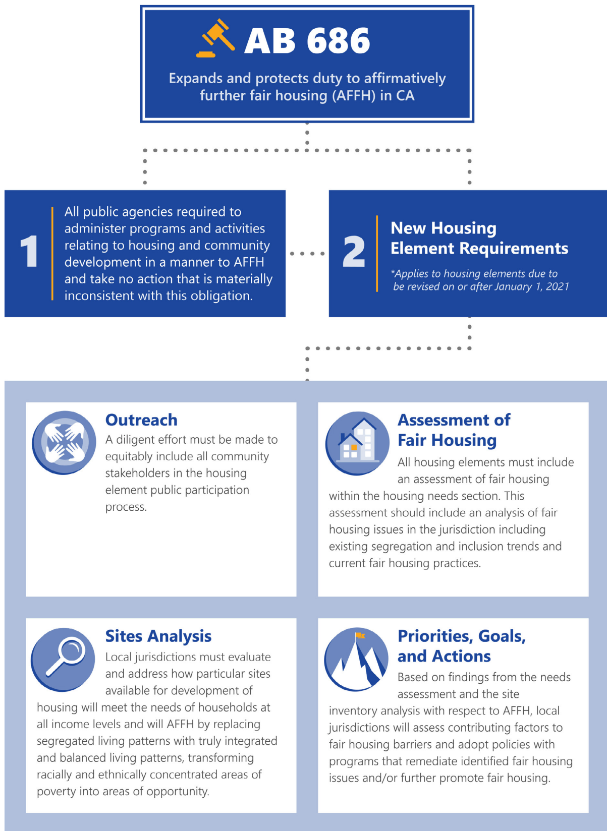
Chart 1: Summary of AB 686 Requirements