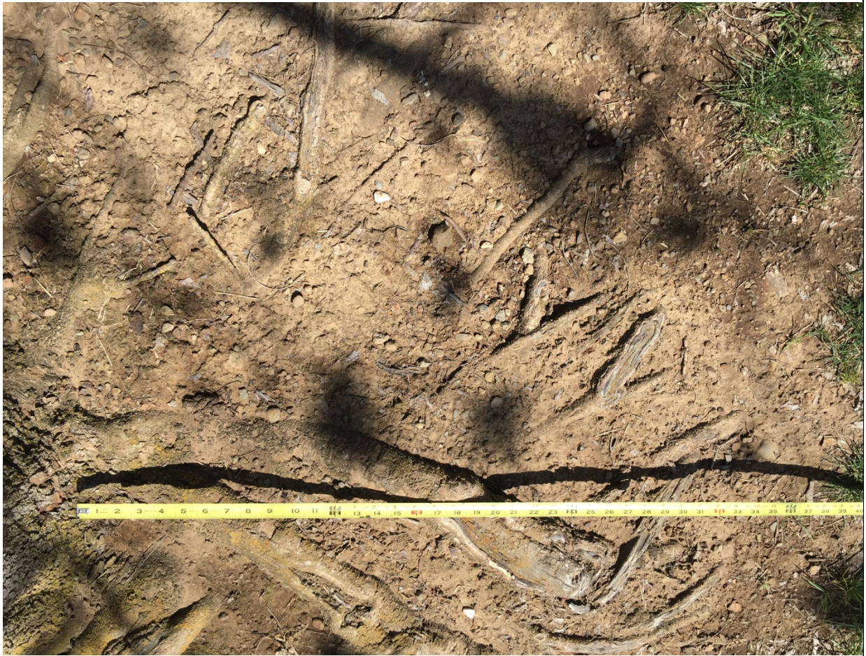
Attachment B, example of exposed root present in trees located in the southernmost row of Library Field. Approximately 3 feet of exposed roots are visible. (View is rotated so the image could be captured with few shadows.)