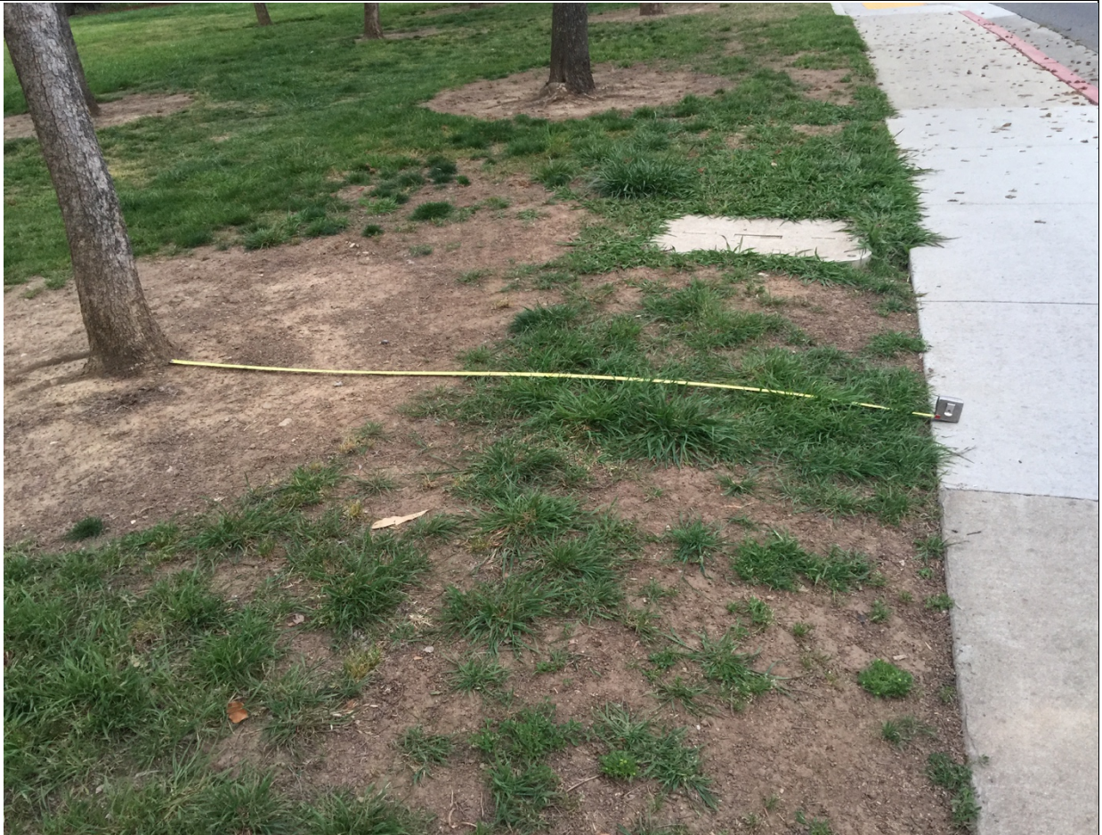
Attachment B, distance from tree trunks to sidewalk is about 7-8 feet. Note the bend of the tape measure indicates raised elevation of the open ground relative to the sidewalk.