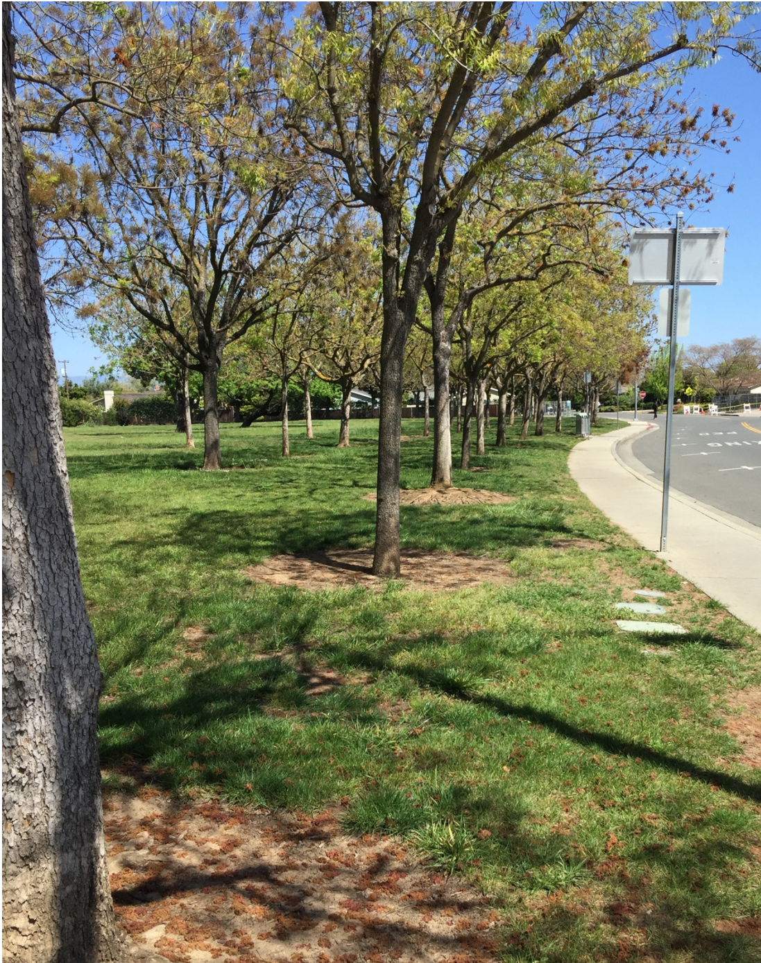
Attachment B, view of the southernmost row of trees in Library Field, from near Torre Ave looking east