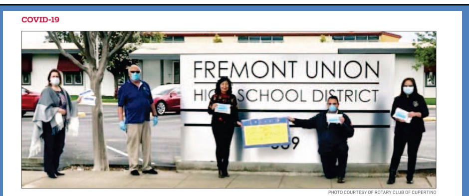
Members of the Rotary Club of Cupertino deliver protective masks to the Fremont Union High School District offices. The club expects to have more masks to distribute thanks to donations from the Rotary Club of Kaohsiung West in Taiwan.