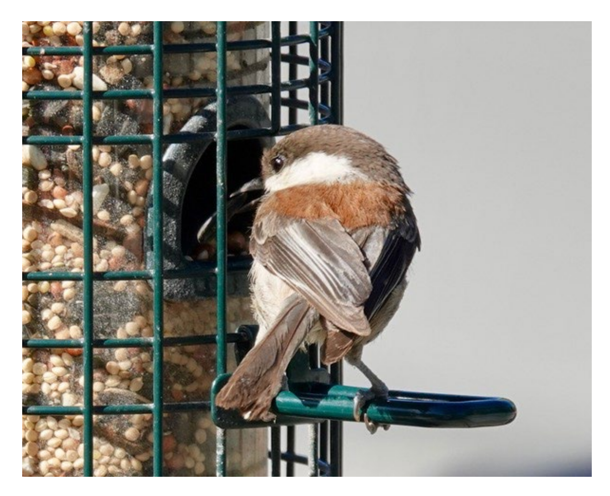
House Finches, female and male