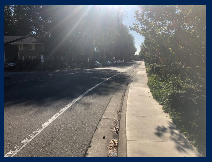
Looking to east - unlimited'