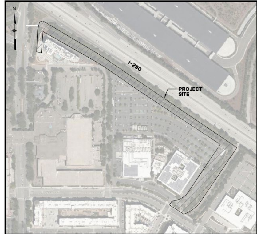
SITE MAP NO SCALE