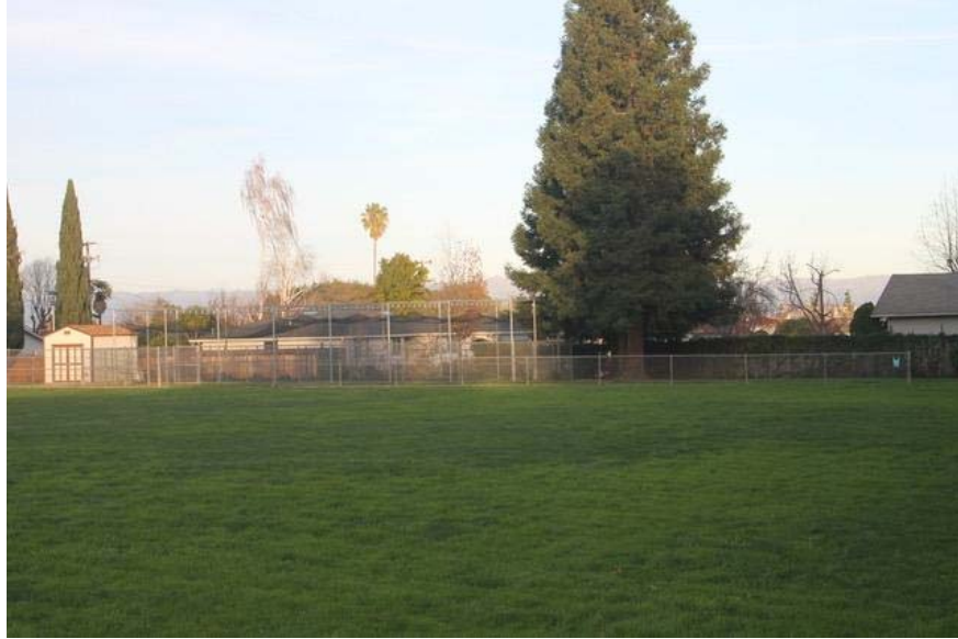
D. Jollyman Park in the evening (looking east)