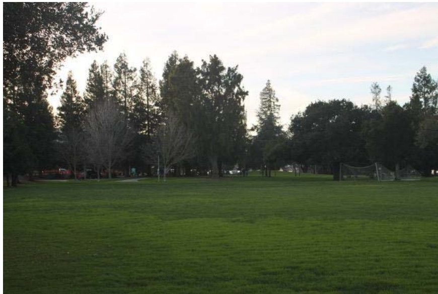
D. Jollyman Park in the evening (looking west)