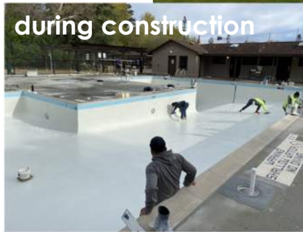
Blackberry Farms Pools