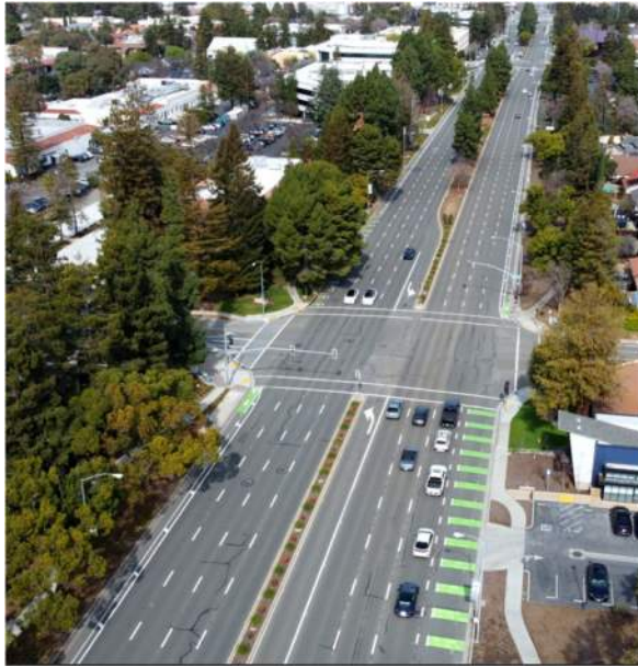
DeAnza Bike Lanes