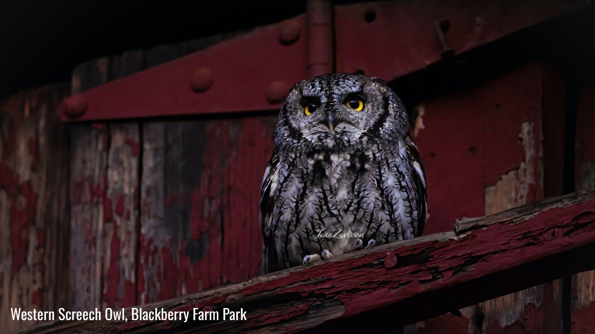
Western Screech Owl, Blackberry Farm Park