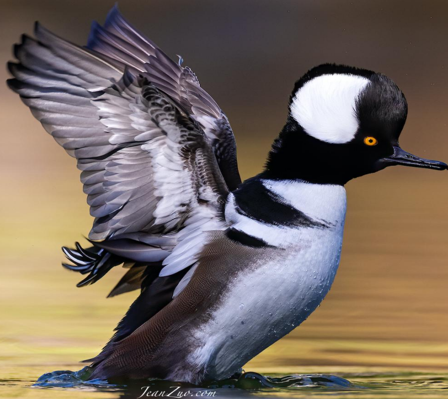
Hooded Merganser, Rancho San Antonio