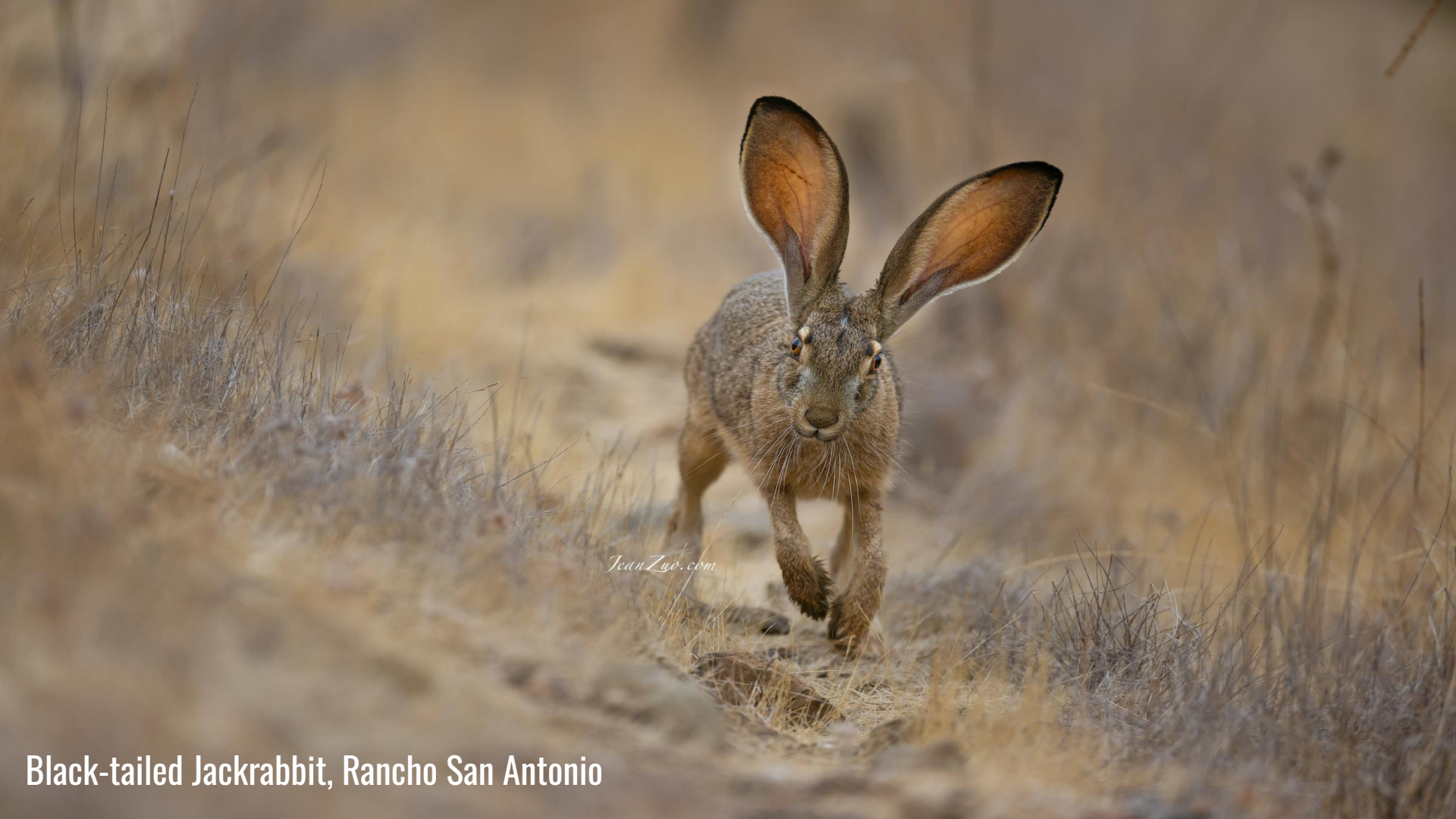
Black-tailed Jackrabbit, Rancho San Antonio