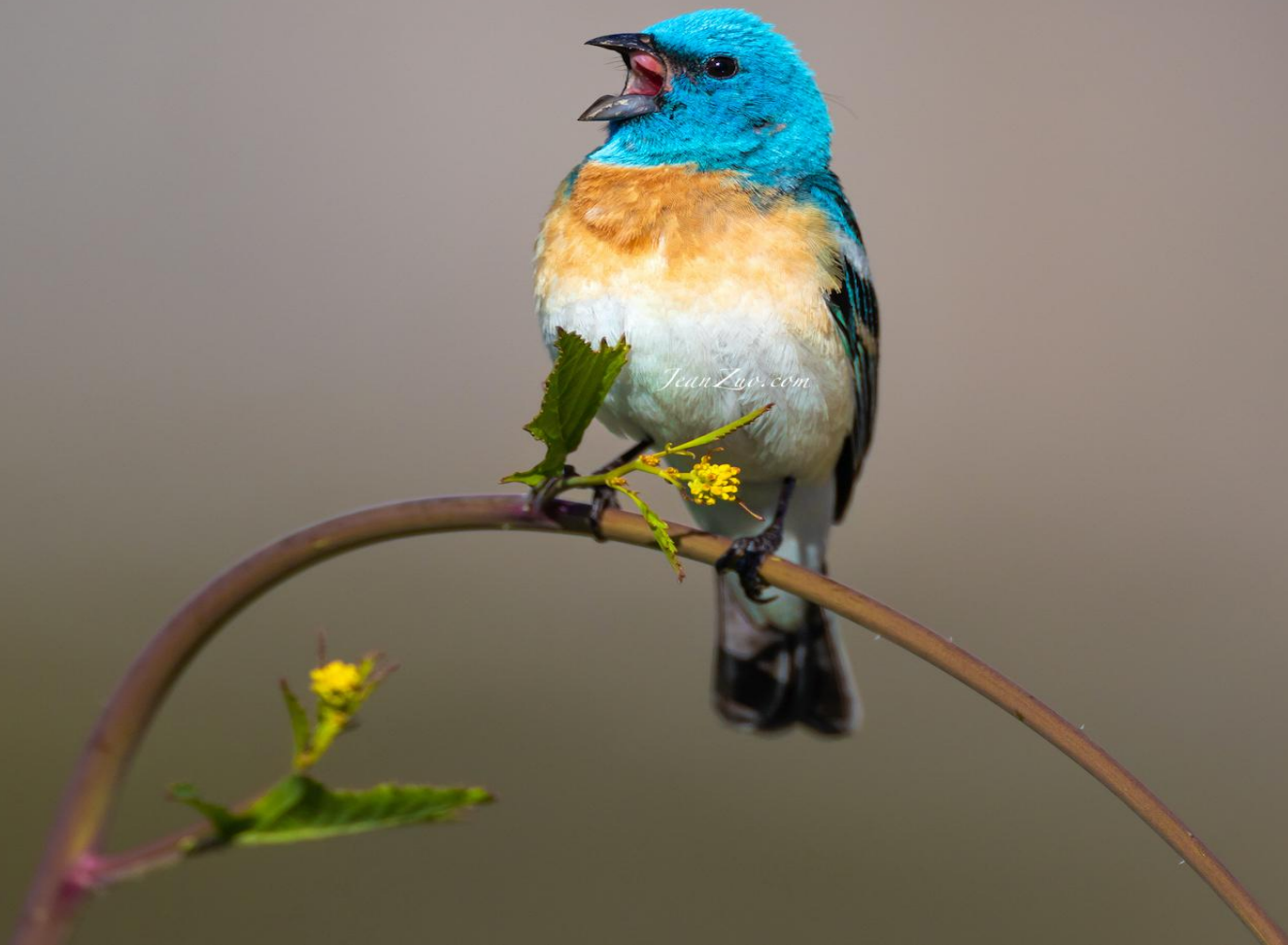
Lazuli Bunting, Rancho San Antonio