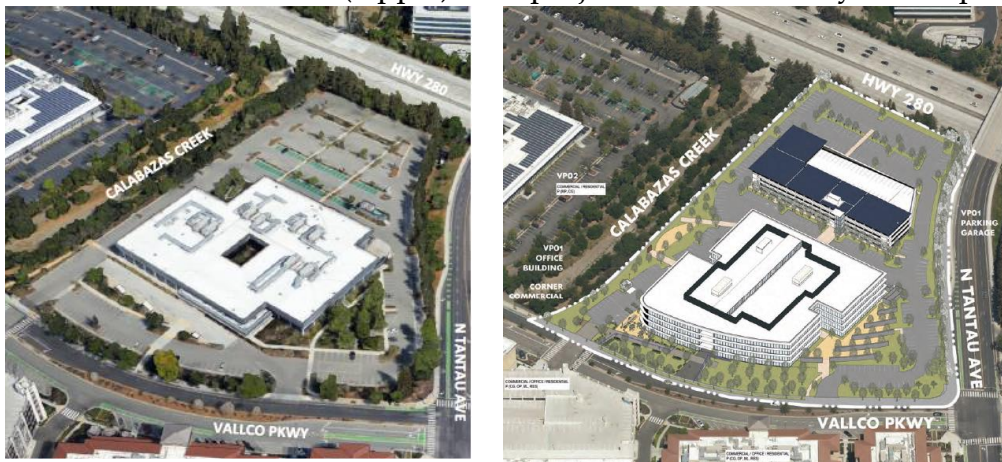
Figure 1 Existing office building (left) and proposed (right).

The proposed Vallco Parkway 1 (VP1) Apple Office project (proposed project) is located on a 7.96-acre site that is proposed for redevelopment by Apple Inc. The project site is located at 19191 Vallco Parkway at the intersection of Vallco Parkway and North Tantau Avenue. The project site is surrounded by Interstate 280 and office uses to the north across Interstate 280; office uses to the east across North Tantau Avenue; commercial, office, residential, and hotel uses to the south across Vallco Parkway (Main Street); and office uses to the west across Calabazas Creek (Apple). The project site is currently developed with an office building built between 1980 and 1982 and operated by the project applicant, with associated surface parking and landscaping.