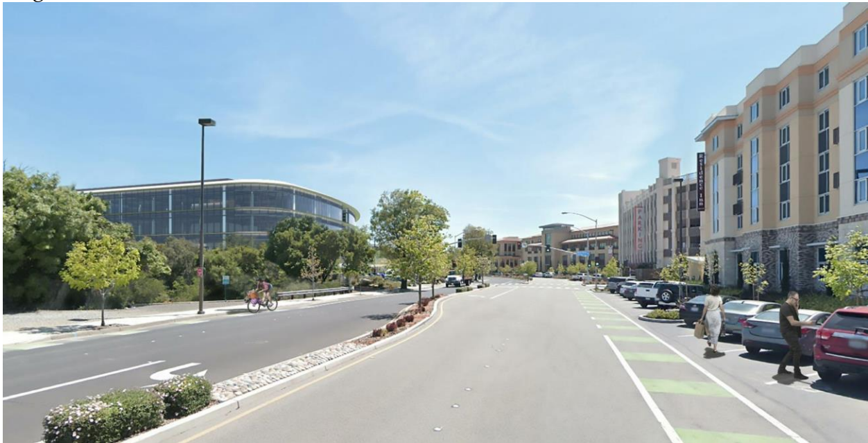
Figure 4 Rendering of the proposed Building (left) looking west along Vallco Parkway.

The proposed building is a modern structure similar in design to the surrounding office architecture along Tantau Avenue north of Highway 280. Consistent features include deep overhangs and an open window design that avoids large expanses of solid walls. The massing and height of the building are proportionately scaled to fit the context of the neighborhood.