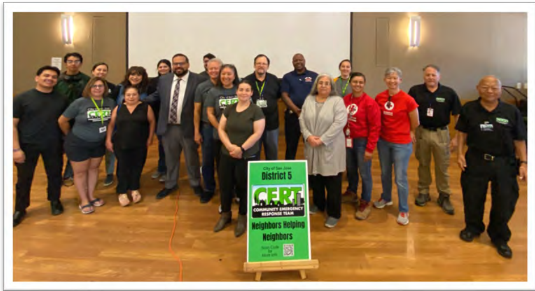
In November, Valley Water, along with other emergency preparedness organizations, presented flood preparedness tips at the Mayfair Community Center in San José.

In December 2023, the Organization for Latino Affairs (OLA) provided Valley Water’s emergency starter kits, English and Spanish flood preparedness information, and giveaways to approximately 500 attendees at the Santa Visits Alviso Foundation event in San José.