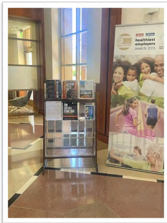
Valley Water HQ Lobby Displaying FY24 Flood Readiness Materials