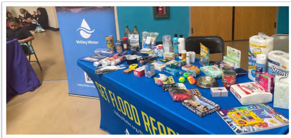
Valley Water provided flood-preparedness materials at the Eggstravaganza Family Event in San Jose.

Water also participated in an educational workshop with 40 attendees at The Links, Incorporated “Emergency Preparedness: Safety Now, Peace Later” event at the African American Community Service Agency in San Jose.