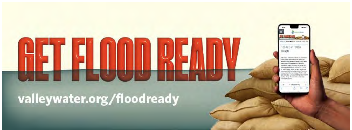
Get Flood Ready banners placed throughout the County in Valley Water hotspot areas.

Valley Water also hung 'Get Flood Ready' banners in 10 areas identified as flooding hot spots. The banners included our calls to action and a QR code leading to our ValleyWater.org/floodready page. A display featuring the contents of an emergency kit was placed at a prominent location in Valley Water's headquarters. Readiness materials were made available.