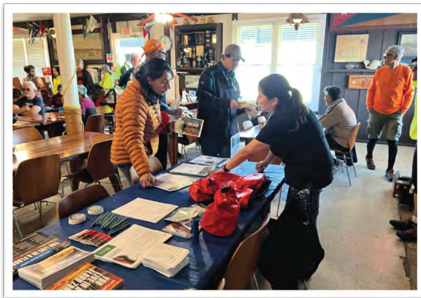
Valley Water provides “Get Flood Ready!” materials and tips at Silicon Valley Bicycle Coalition’s King Tide Ride event in the Alviso community in north San José.

In February 2024, Valley Water partnered with Sacred Heart Community Service to provide free emergency starter kits and multilingual educational materials to distribute at events to help residents “Get Flood Ready!” In addition, Valley Water hosted a booth with “Get Flood Ready!” materials at the Silicon Valley Bicycle Coalition’s King Tide Ride Event 2024 held on February 10, 2024, at Riverwalk Park in San Jose.