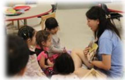
Summer Science Fun/Nature Camp