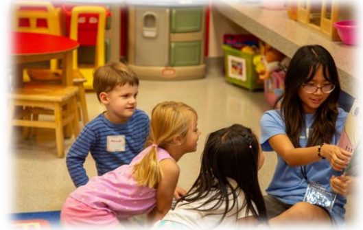
Summer Science Fun/Nature Camp