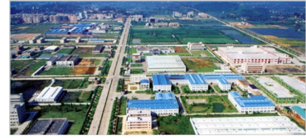
Figure 2 Factory area within the Zhaoqing High-Tech Industry Development Zone

Business Exchanges: The Committee will provide businesses from the two cities to identify areas of potential mutual collaboration. The Zhaoqing government is interested in investing in high-tech industries and has been encouraging industrial development including the formation of Guangdong Zhaoqing High-tech Industrial Development Zone, with an area of 42 square miles that consists of two industrial parks, Sanrong Industrial Park and Dawang Industrial Park. Dawang is facilitated as an export processing and trade zone.