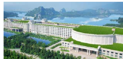
Figure 3 Top-rated hotel in Zhaoqing, the OYC Hotel

Zhaoqing is a city of almost 4 million residents in the Guangdong province of China. Zhaoqing is located about 70 miles northwest of Guangzhou, in the west Pearl River Delta. It lies on the north shores of the Xi River, which flows from west to east. Numerous rice paddies and aquaculture ponds are found on the outskirts of the city. A plain area lies to the south and west of Zhaoqing, with mountains to the east and north.