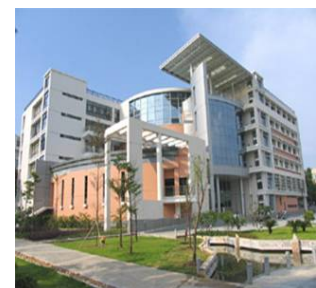
Figure 4 Zhaoqing University

Zhaoqing is one of the ancient cities in the history of China, first being named Gaoyao county in the Han Dynasty, before being changed to Duanzhou, Sihui and Gaoyao. It was finally renamed Zhaoqing in the Qing dynasty. Zhaoqing was one of the first places in inland China to be visited by a foreigner, the Jesuit priest Matteo Ricci who settled there in the sixteenth century.