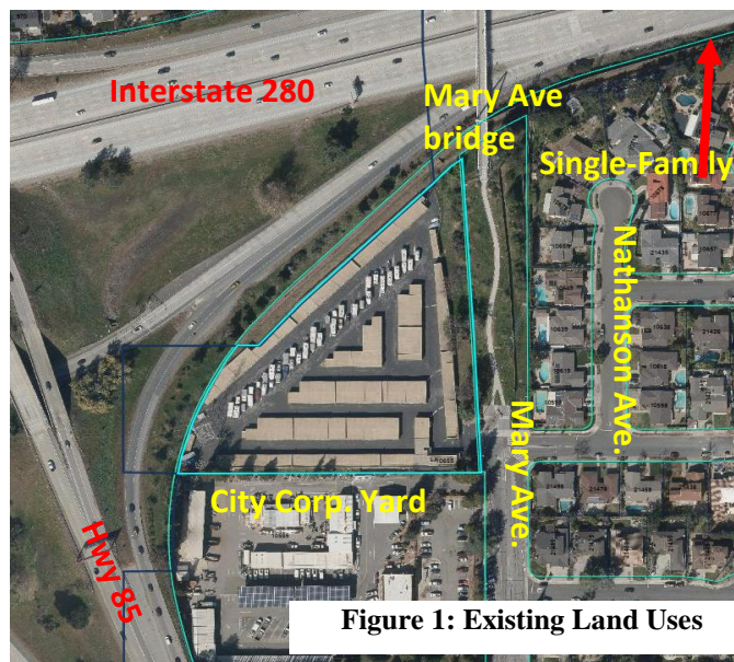
Figure 1: Existing Land Uses

Land use surrounding the project include Interstate 280 (I-280) to the north, the Mary Avenue Bridge path