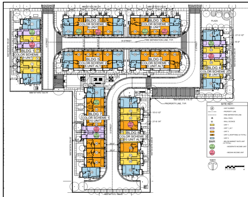
Figure 2: Site Plan

income households. The project also includes the removal and replacement of 45 protected development trees (see Figure 2 for Site Plan 10 ). Based on the scope of work, the City has required the following permits: Development Permit, Use Permit, Architectural and Site Approval, Tree Removal, and a Vesting Tentative Map. Based on State Density Bonus Law, the applicant is requesting density bonus waivers, as described later in this report.