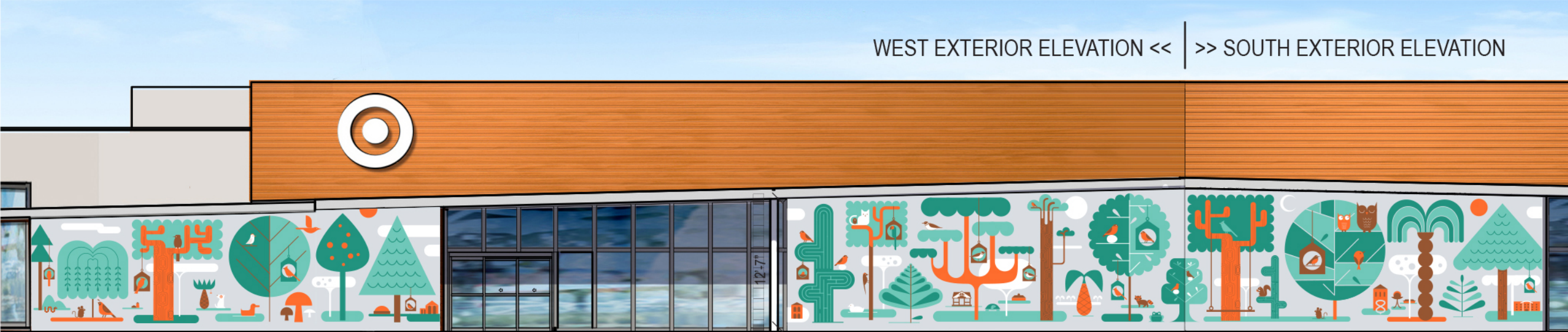
ART WALL 3: West Cupertino

WEST EXTERIOR ELEVATION << | >> SOUTH EXTERIOR ELEVATION