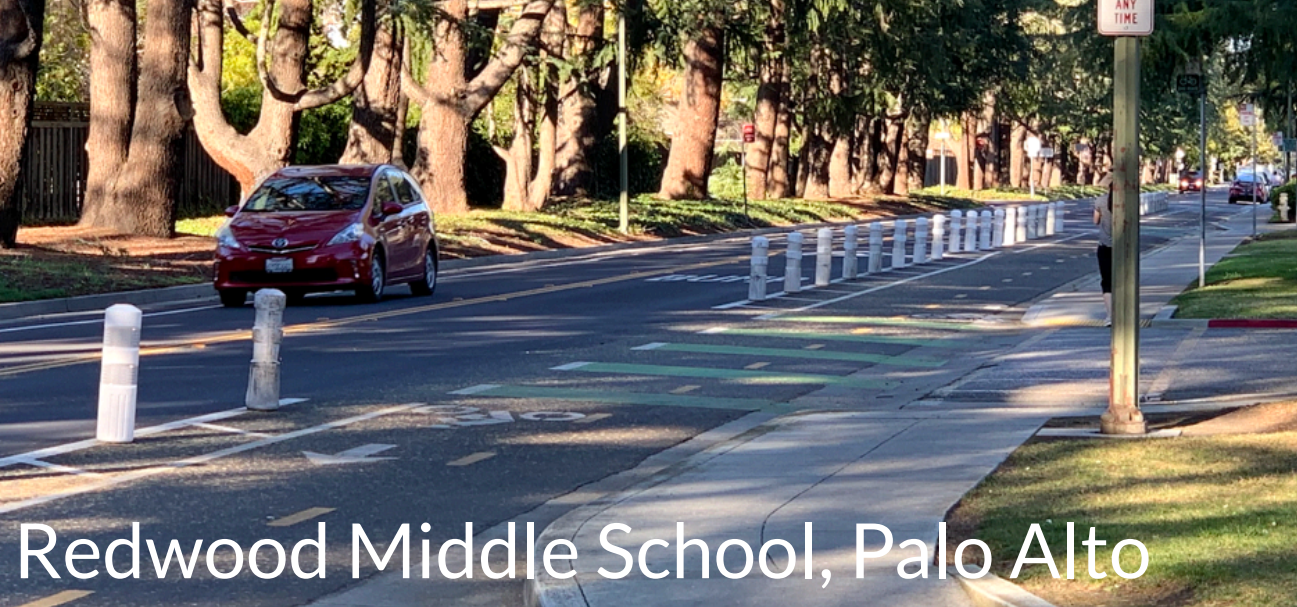
Redwood Middle School, Palo Alto