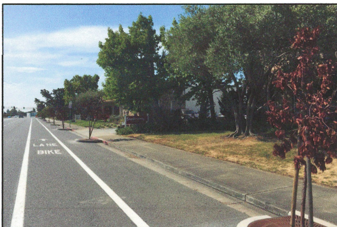
Trees can even be planted in the street (Industrial Ave. in San Carlos).

Planting SMALLER trees = faster growth; healthier trees. This one-gallon Sycamore had seven leaves 20 years ago.