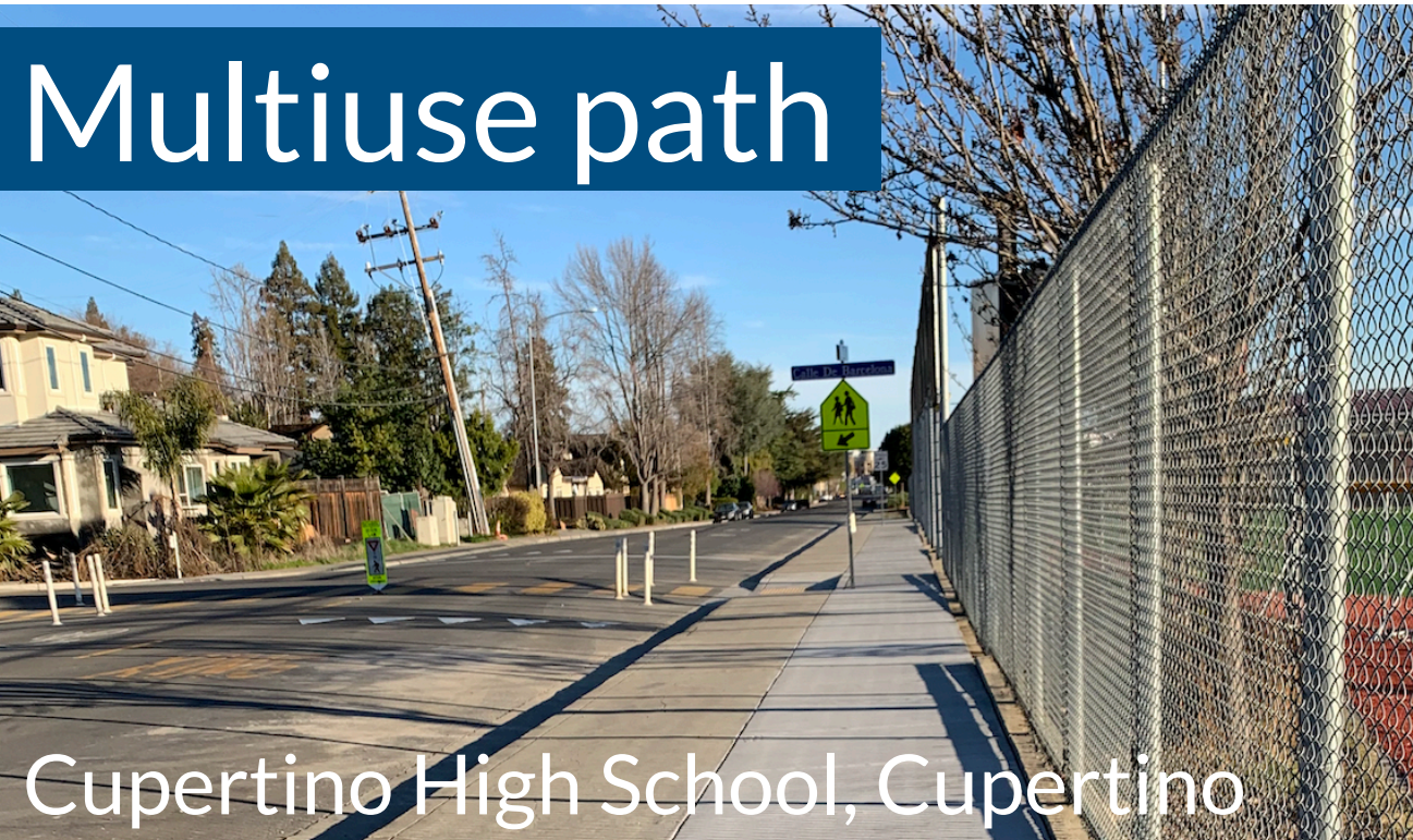
Cupertino High School, Cupertino