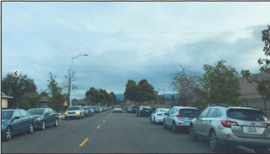
Vista at 5:15 pm; it will get MUCH WORSE with new laws. Plan ahead - KEEP THE PARKING.