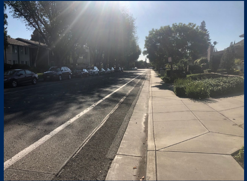
Looking to east – unlimited'