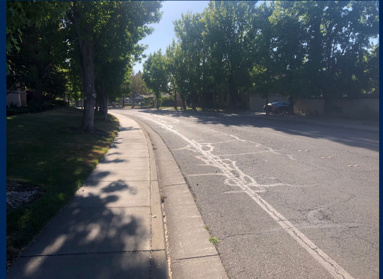
Looking to east – 240'