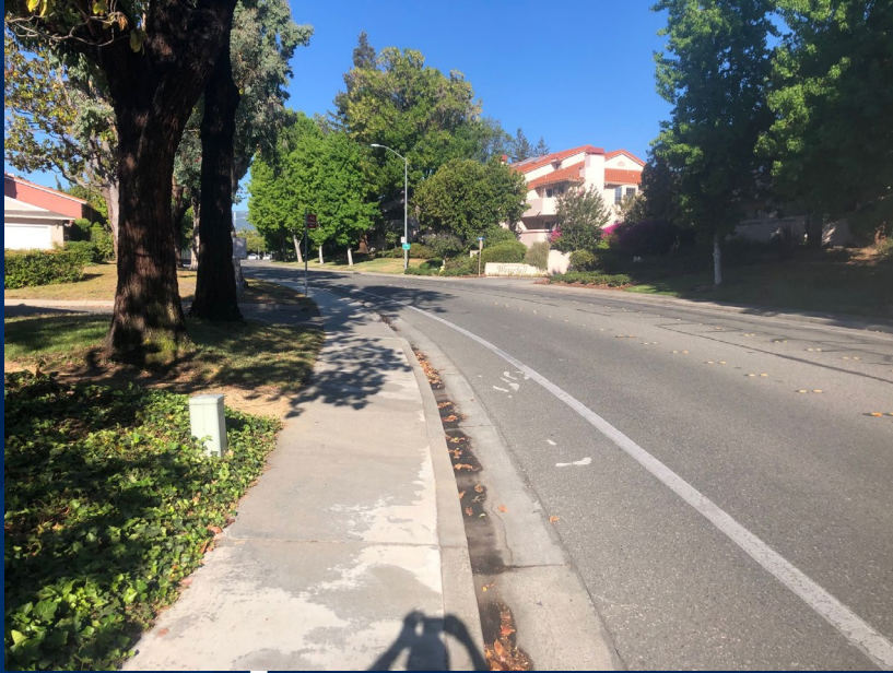
Looking to west – 200'