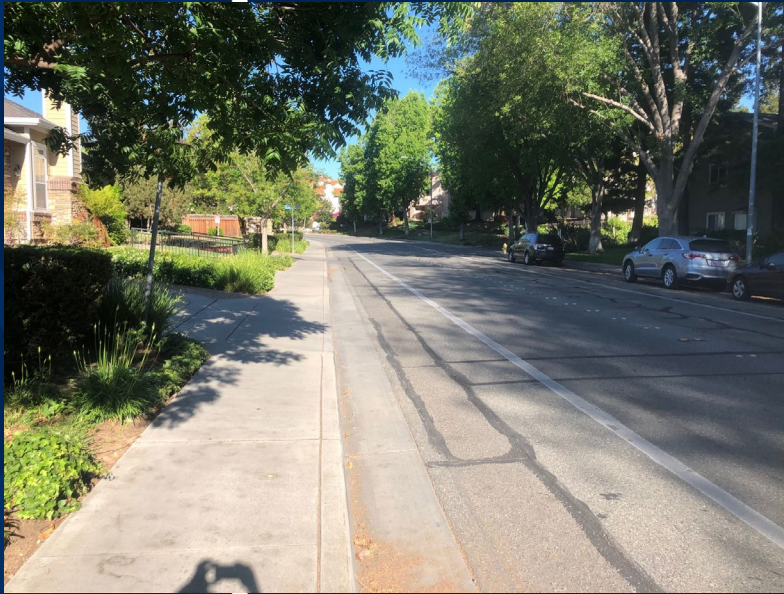
Looking to west – 310'