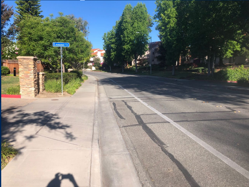
Looking to west – 200'