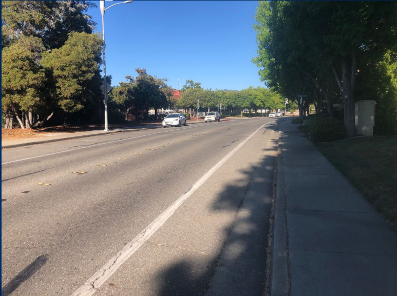
Looking to west - unlimited