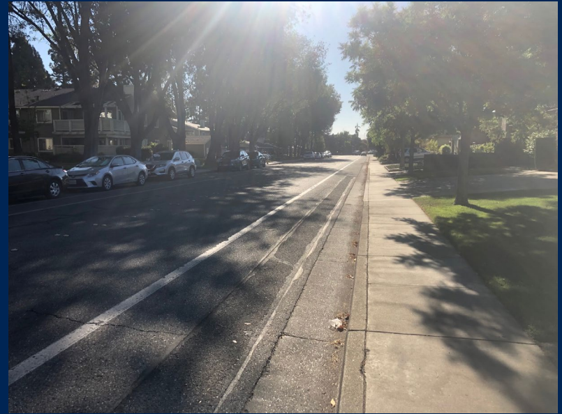
Looking to east – unlimited'