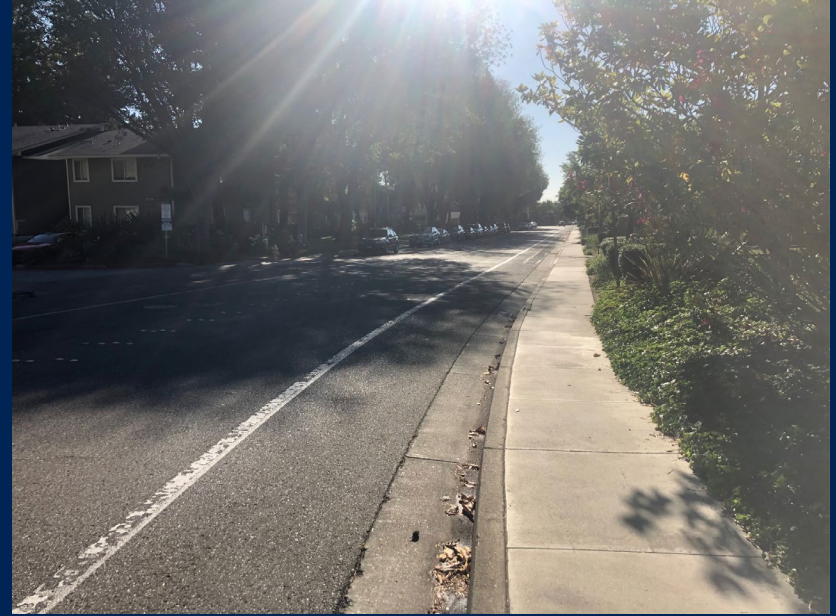
Looking to east – unlimited'