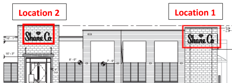
Figure 3 East facade proposed signs.